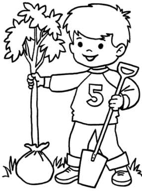
Arbor Day is a day for planting trees.